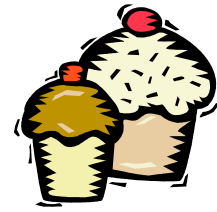
Yummy Cupcake with Sprinkles and a Cherry

The story was okay. I did not learn anything new.